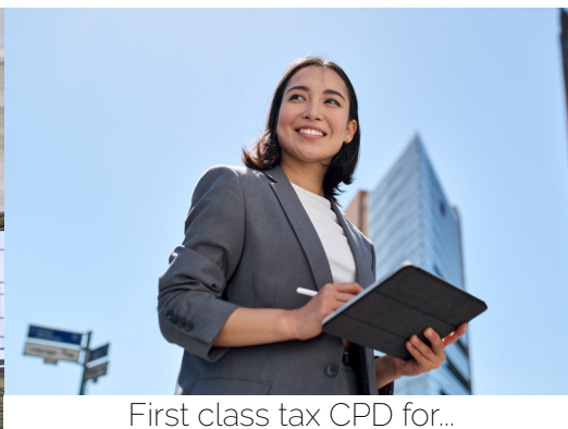
First class tax CPD for... Corporate Sector