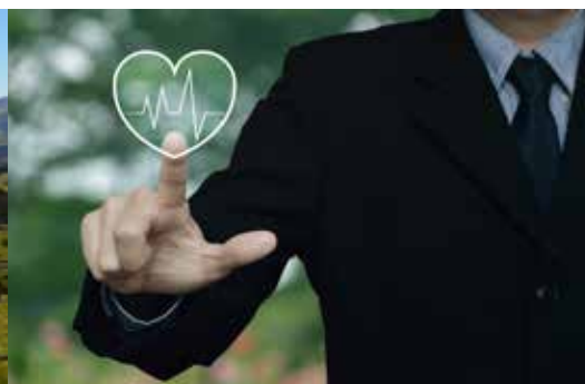
Tax Update 2020