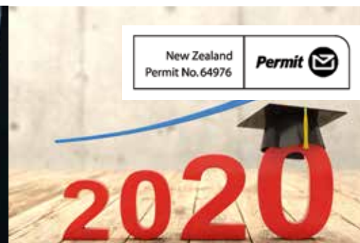
and much more....